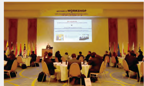
▲ ACCSM+3 International Workshop

Also, responding to requests from developing countries to improve their governance by studying Japanese civil service system, the NPA cooperates by carrying out various training programs targeting government officials from these countries.