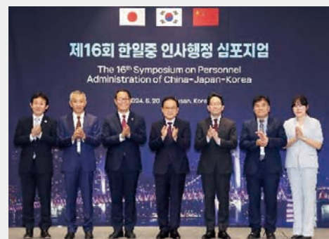
▲ China-Japan-Korea Personnel Policy Network 16 th Joint Symposium

With the aim of promoting close cooperation and mutual exchange in the field of personnel administration as part of the trilateral cooperation program, the personnel administration agencies in Japan, China and Korea, namely the NPA, the National Civil Service Administration of China and the Ministry of Personnel Management of Korea, implement various cooperation programs.