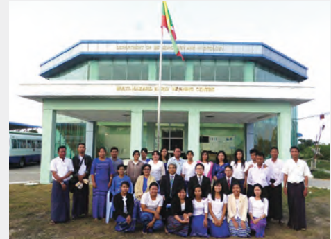
▲ Work scene of the dispatched personnel (Dispatched personnel: Center row, fourth from left)