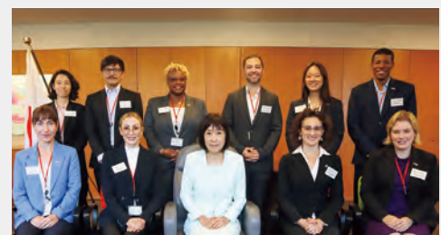
▲ Trainees for the 28th Mike Mansfield Fellowship Program

The NPA invites senior government officials of foreign countries to Japan in order to exchange information on recent practices and issues of personnel administration. Also, the NPA carries out the program (Mike Mansfield Fellowship Program) to offer young and mid-level U.S. federal government officials the opportunity to take one-year on-the-job training at the ministries and agencies, etc.