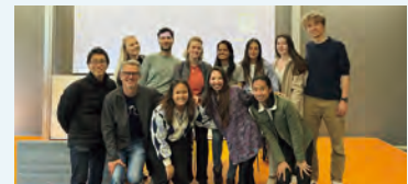
▲ Dispatched fellow at Tilburg University (Netherlands)

<Recent Reviews> 1-year course is newly established from FY2024.