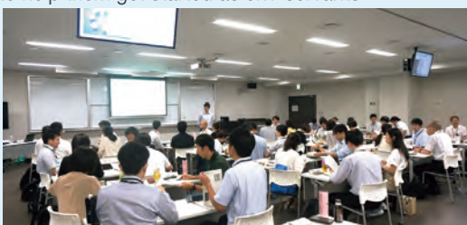
▲A scene from a training for recruits with business experience

The training course provides employees who have been hired by ministries and agencies from private companies with necessary knowledge and gives them opportunities to socialize with each other to help them get started as civil servants.