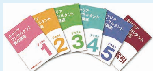
▲Textbooks used in training courses during FY2024

The course is designed to support trainees to acquire a career consultant certification in order for them to play a key role in promoting career development initiatives in each ministry and agency.