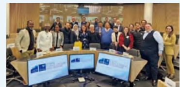
▲ Leader fellow at University of Oxford (United Kingdom)

<Recent Reviews> Leader Fellowship Course, in which managers are dispatched to graduate school abroad for a short period, is newly established in FY2024.