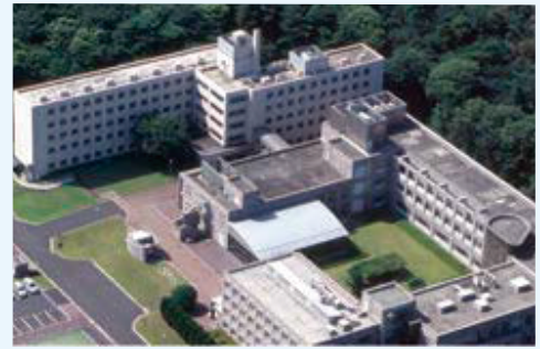
▲ The National Institute of Public Administration